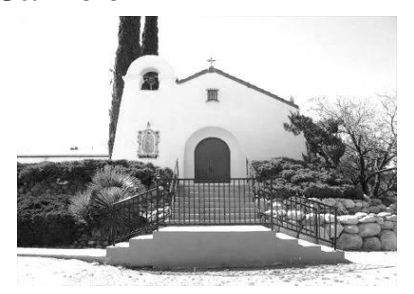
66 E. Maplewood St. Oracle, Arizona, 85623