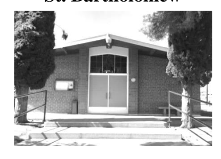
609 W. Park Pl San Manuel, Arizona, 85631