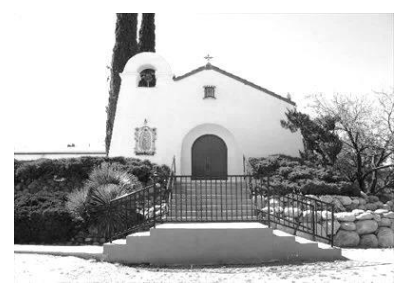
66 E. Maplewood St. Oracle, Arizona, 85623