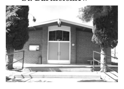
609 W. Park Pl San Manuel, Arizona, 85631