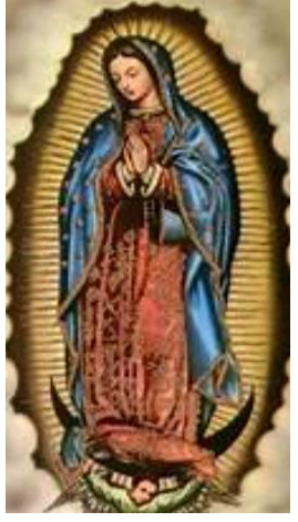
Holy Mass Times Wednesday Dec. 11<sup>th</sup> at 5:00PM

Wednesday Dec. 11<sup>th</sup> at 5:00PM Blessed Sacrament Church Mammoth