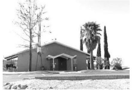
122 Church Drive Mammoth, Arizona, 85618