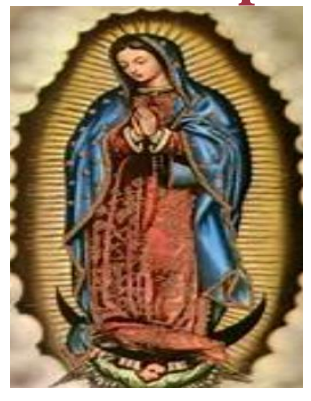
Holy Mass Times

Wednesday Dec. 11<sup>th</sup> at 5:00PM Blessed Sacrament Church Mammoth