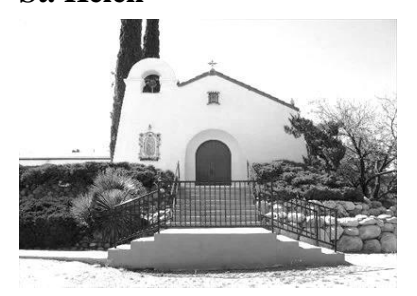
66 E. Maplewood St. Oracle, Arizona, 85623