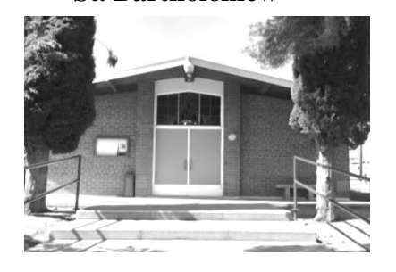
609 W. Park Pl San Manuel, Arizona, 85631